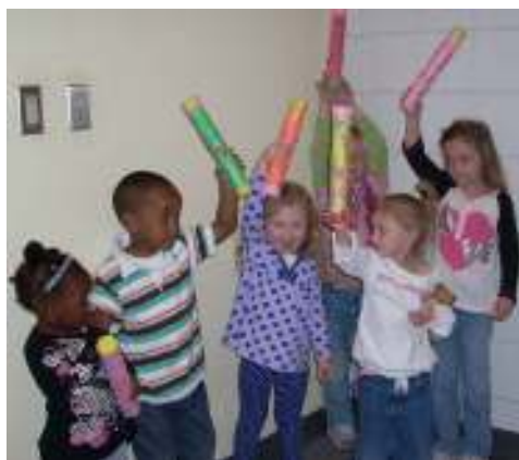
Children & Their "Rain" Sticks from Jazz Program Celebrating Black History Month