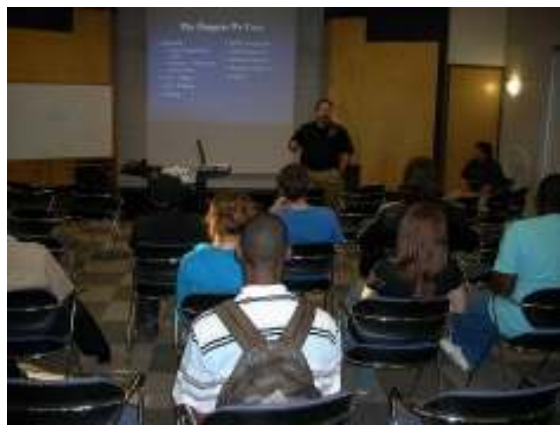
Online Safety Program

The YS Staff planned, practiced and presented nine story time programs in February for toddlers, Pre-K, and school-aged children. They also conducted eight special programs for children and four special programs for teens. YS staff had one outreach program at Cumberland Mills Elementary School. Below are pictures from two of the programs.