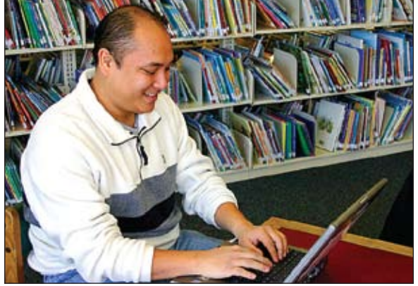
You can find free Wi-Fi access at your library.