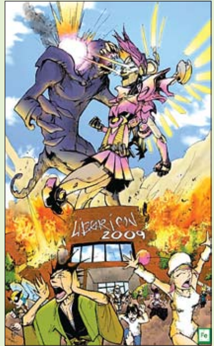
Librari-Con attracts anime and manga fans, artists and authors.

Fourth Fridays attract hundreds of participants to culturally relevant programs each month at Headquarters Library. Our programs include music ranging from Bluegrass and the Blues to Big Band and Classical.