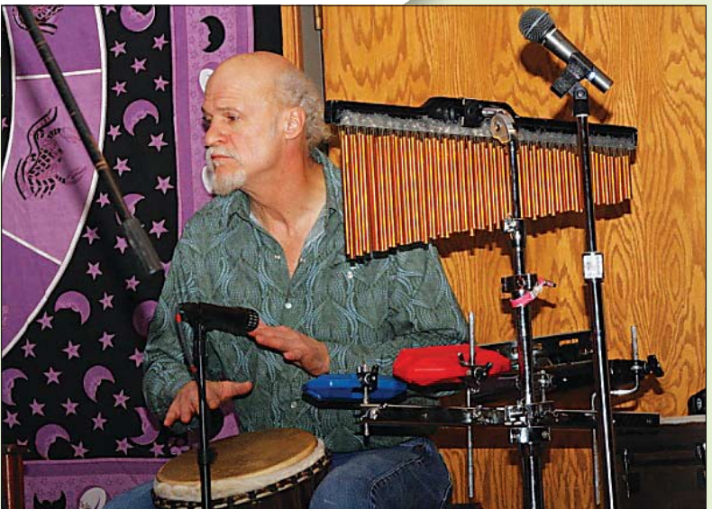
This drummer is playing as part of the Bohemian Festival held in November at Headquarters Library.

“My child was so excited after the ‘Pirate Zone’ that he raced to the phone and called his grandmother to tell her all about the program and the different things he got to do there. I just wanted you to know that I appreciate all that you guys do at the library.”