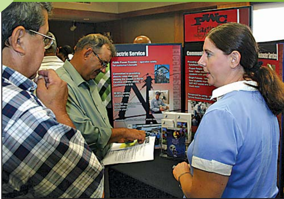
A representative from Public Works Commission shares employment information at the library's first Job Fair held in August.

You can find a Job & Career Resource Center at every library location. Specific computers have been configured to directly access databases and other online resources. Staff is available to offer assistance as needed and even to schedule time to assist with resumé development or to help with accessing online job applications.