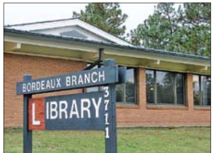
Bordeaux Branch Library on Village Drive will undergo a transformation with an expanded public computer lab and new technology.

Check the library's website for updates as this project progresses.