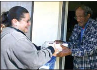
Mobile Outreach staff delivers library materials to homebound residents.