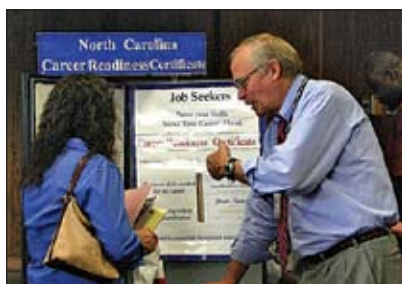
More than 650 people took advantage of job and career information at this year's Job Fair held at Headquarters Library.