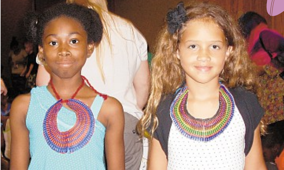
Children from a Summer Reading Club activity proudly show off the necklaces that they just created. Programs such as these are made possible through funding from the Friends of the Library.