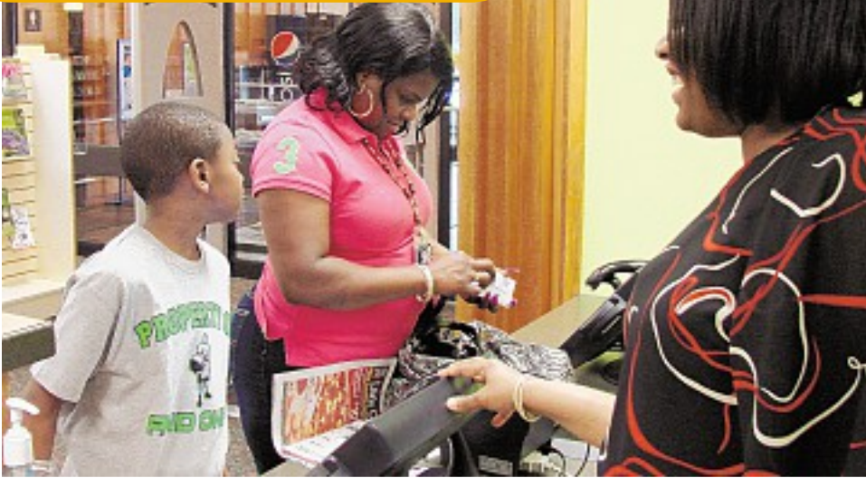
Customers take advantage of self-service checkout.

This year’s transformation at Bordeaux Branch Library on Village Drive provided a much needed reallocation of space and “freshening up.”