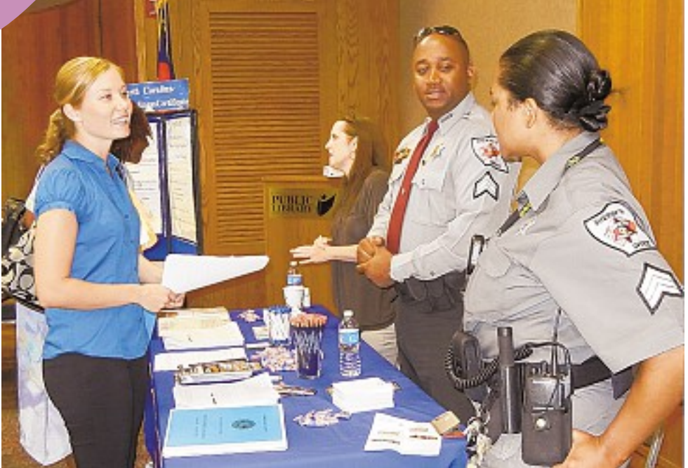
Deputies from the Cumberland County Sheriff's Office share employment information at the Job Fair.