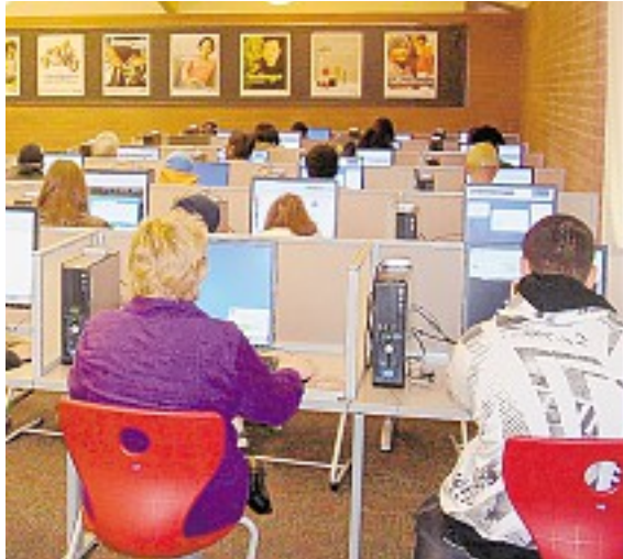
Bordeaux’s new computer lab offers a spacious and comfortable environment.

Using customer feedback to make this location better, the library’s facelift includes a new computer lab that has increased the number of public computers from nine to 30. Taking advantage of the natural lighting from the picture windows, the children’s collection is now in the front of the building and includes a colorful hand painted mural. New carpet, furniture and the return of the quiet study room significantly improve the overall look and comfort of this location.