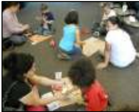
Sixteen attendees commemorated Hispanic Heritage during the Cinco de Mayo program. Those who attended created a craft and watched a movie celebrating Cinco de Mayo ( photo left ).

Twelve mothers and children attended the Mother & Child Play Day program. Moms celebrated Mother's Day by bringing their children to the program with books, songs and toys. Parents also networked and reviewed child development resources.